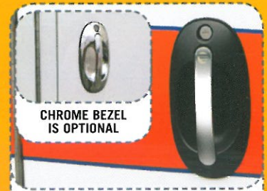
CHROME BEZEL IS OPTIONAL